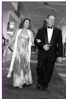
Guests arrive to FurBall 2008 in high-style