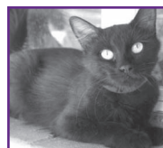
Her legacy lives on....