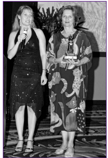
Top, Miss Money Penny received the Logan Award; Above, Feline Foundation received the Katherine Award