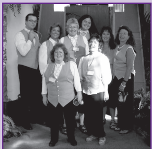
MHS volunteers working hard and having fun at the party.